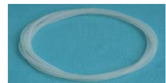
Ozone Teflon Tubing